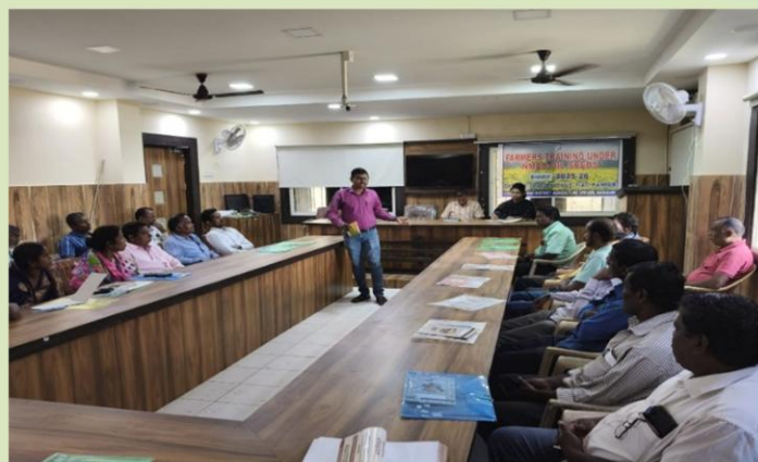
A talk was delivered by Farm Manager, KVK, Nayagarh on production technology of oilseed crops under National Mission on edible oil at FIAC, Ranpur.