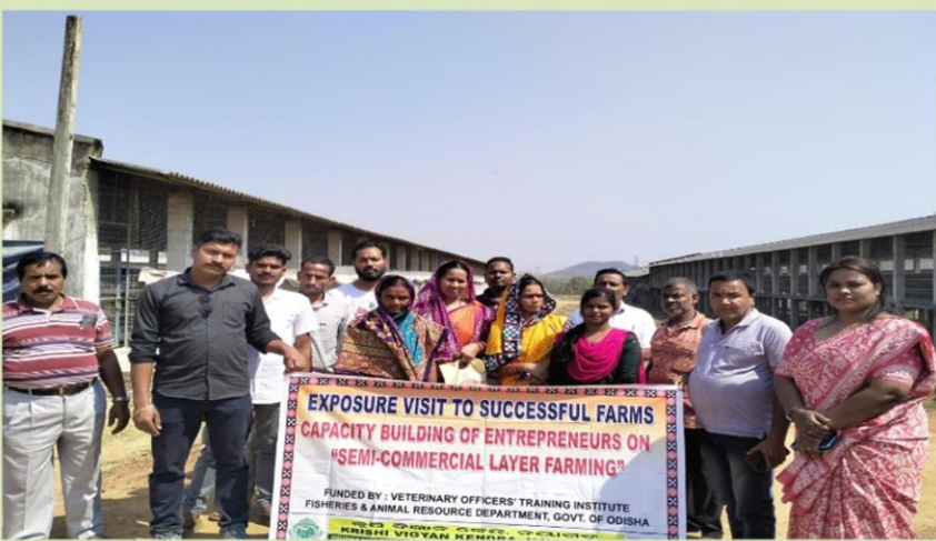
EXPOSURE VISIT TO SUCCESSFUL FARMS CAPACITY BUILDING OF ENTREPRENEURS ON "SEMI-COMMERCIAL LAYER FARMING" FUNDED BY: VETERINARY OFFICERS' TRAINING INSTITUTE FISHERIES & ANIMAL RESOURCE DEPARTMENT, GOVT. OF ODISHA

To enrich egg production in the district and to create youth entrepreneur, FARD, Govt. of Odisha has taken an initiative for skill upgradation training programme through VOTI, BBSR. Under this training programme on semi commercial layer farming was conducted on 19th – 21st, February, 2026. Twenty no. of interested trainees participated in the programme. theory classed followed by practical session and field visit to progressive farmers