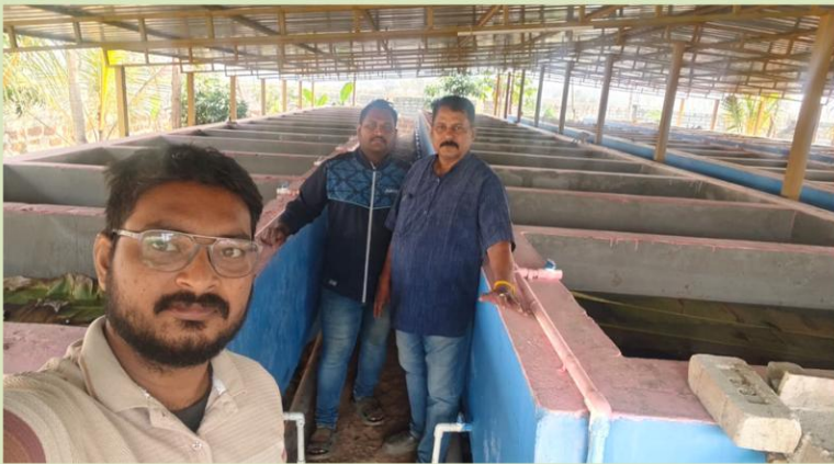
Field visit of SS & H , KVK, Nayagarh to Ornamental Fish unit and Sunflower Wheat intercropping field where the farmers has implemented intercropping techniques of village- Mathagadia, Nayagarh