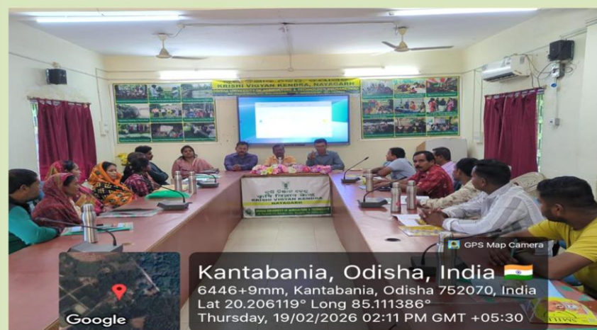
Kantabania, Odisha, India 6446+9mm, Kantabania, Odisha 752070, India Lat 20.206119° Long 85.111386° Thursday, 19/02/2026 02:11 PM GMT +05:30

To enrich egg production in the district and to create youth entrepreneur, FARD, Govt. of Odisha has taken an initiative for skill upgradation training programme through VOTI, BBSR. Under this training programme on semi commercial layer farming was conducted on 19th – 21st, February, 2026. Twenty no. of interested trainees participated in the programme. theory classed followed by practical session and field visit to progressive farmers