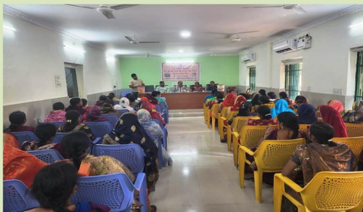
Scientist (Home Sc.) participated in the training programme on Mushroom cultivation for SHG members at DDH office, Nayagarh